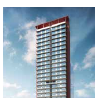
Eminence, Mulund (W)