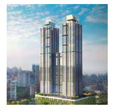
Monte South, Byculla

We are currently building several townships in the fastest growing neighborhoods, affordable housing projects, ultra-luxury skyscrapers, small offices and large business centers, with projects spread across the Mumbai Metropolitan Region (MMR).