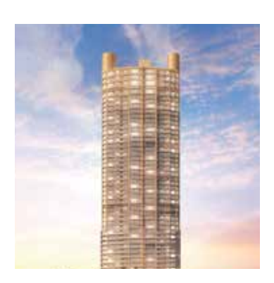
Monte Carlo, Mulund (W)