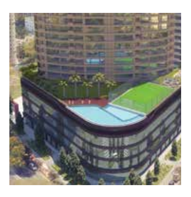
Monte Plaza, Mulund (W)