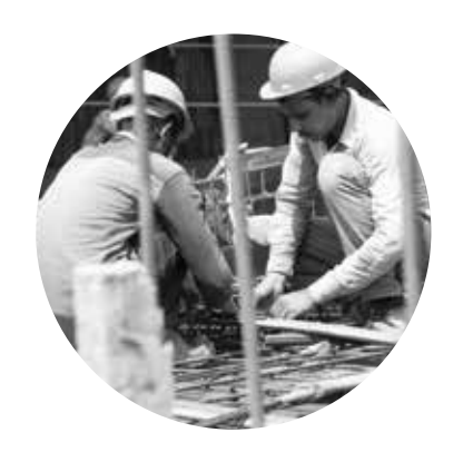
50 years of expertise

With our leadership team having decades of engineering and construction expertise, we have been pioneers of many best practices in the industry. We do not outsource our construction and our engineers retain full control over construction quality.