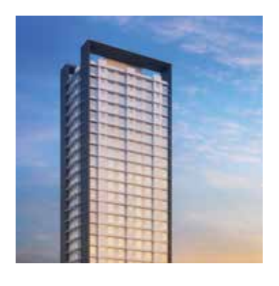
NeoHomes, Bhandup (W)