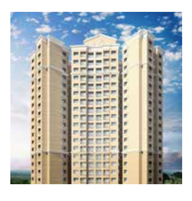
Nextown, Kalyan-Shil Road