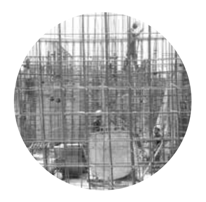
Rock solid construction

With our leadership team having decades of engineering and construction expertise, we have been pioneers of many best practices in the industry. We do not outsource our construction and our engineers retain full control over construction quality.